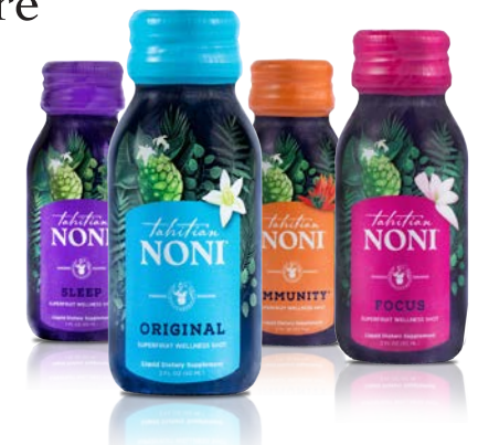
Tahitian Noni Superfruit Wellness Shots